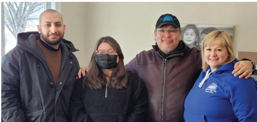
Members of Tungasuvvingat Inuit's Food Crew (not pictured: Hayley Shown & Sherina Strus)

Your compassionate support provides fresh, culturally familiar food to more than 110 partner agencies across Ottawa, including Tungasuvvingat Inuit (TI). TI provides social support, cultural activities, employment and education assistance, youth programs, counselling, and more – to Inuit in Ontario.