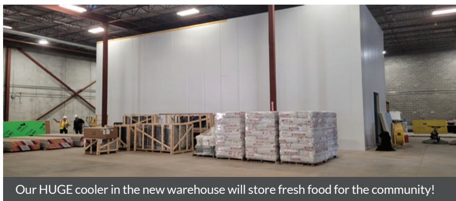
Our HUGE cooler in the new warehouse will store fresh food for the community!