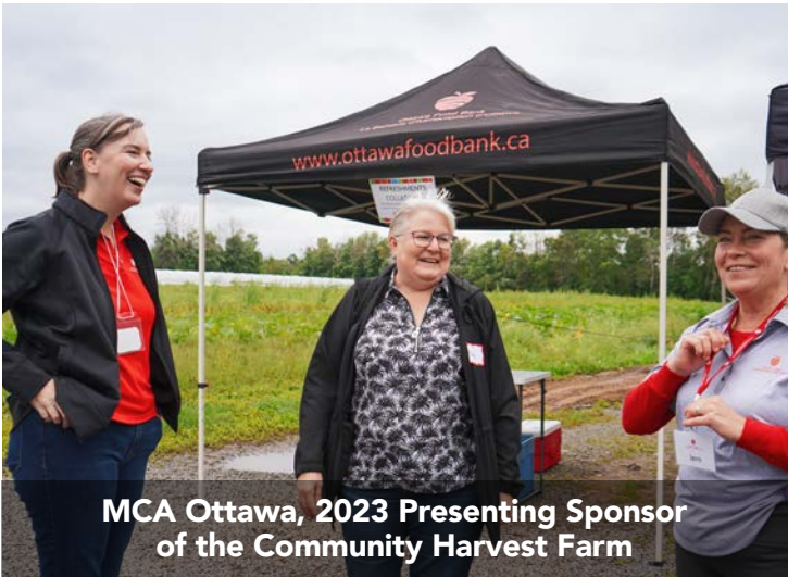
MCA Ottawa, 2023 Presenting Sponsor of the Community Harvest Farm

Thank you to our community partners who donated and raised funds, collected and contributed to food drives, and shared their 'why' this year! From neighbourhood food drives, online birthday fundraisers, and artistic initiatives to large scale virtual events using our peer-to-peer fundraising platform, and so much more, the people of Ottawa rose to the occasion once again. People's willingness to fundraise in new ways and engage their own networks have helped fill thousands of fridges for families and individuals in need. We are so grateful for your generosity and for choosing to support the Ottawa Food Bank. Your continued partnership is much appreciated and most needed. THANK YOU.