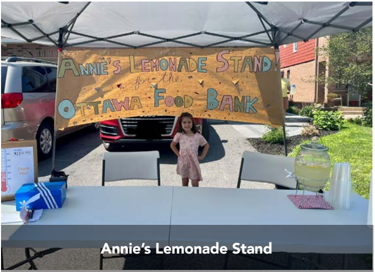
Annie's Lemonade Stand