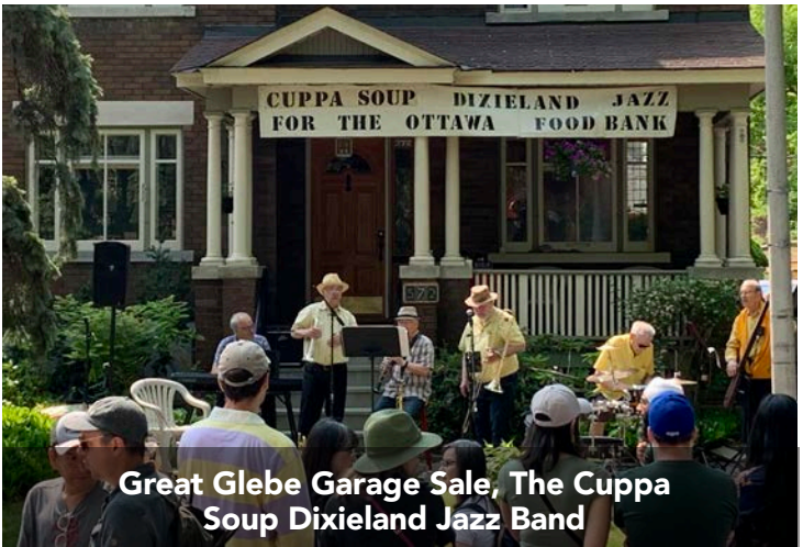
Great Glebe Garage Sale, The Cuppa Soup Dixieland Jazz Band