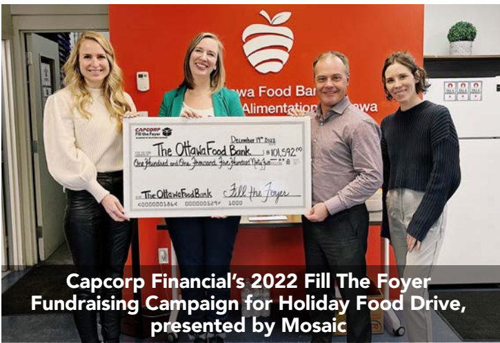
Capcorp Financial's 2022 Fill The Foyer Fundraising Campaign for Holiday Food Drive, presented by Mosaic