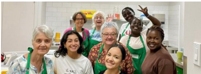
Some of the wonderful staff at CCFC

Your wonderful and compassionate support provides food to more than 110 agency partners across Ottawa!