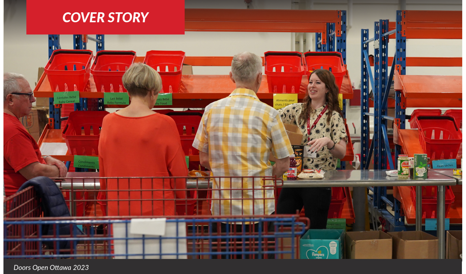
Doors Open Ottawa 2023